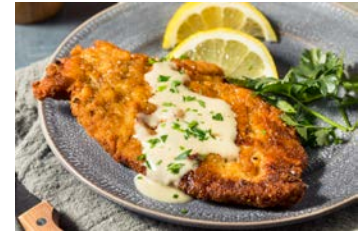
54636-4oz Breaded Pork Cutlets 40pc case | $72.00