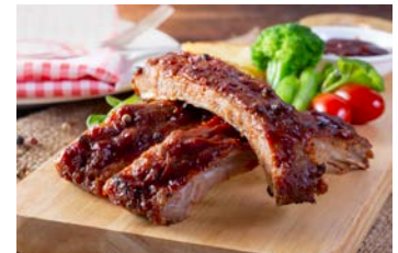
*54854-Pork Baby Back Ribs 11lb case | $72.00