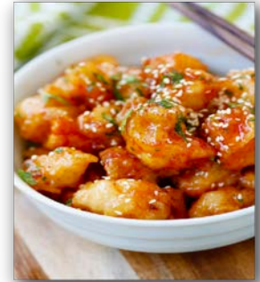
60656-Sweet Thai Chili Chicken 9lb case | $64.00