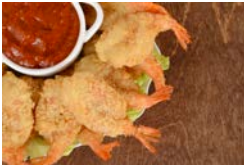
73452- Breaded Butterfly Shrimp 3lb box | $45.00