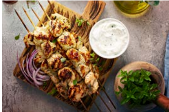
*61569-Chicken Souvlaki Skewers 20 Skewers/case | $68.00