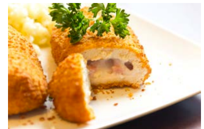
59411- 5oz Chicken Cordon Bleu 30 pieces | $84.00