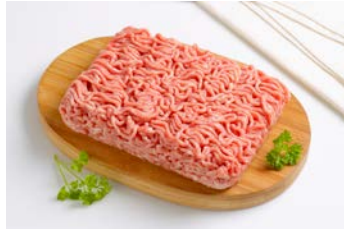
*55731-Ground Pork 5 x 1lb Packages | $30.00