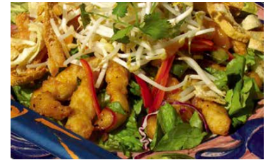
60166- Battered Ginger Chicken Fully cooked w/sauce 8.8lb case | $64.00