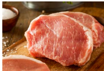
*53565- 6oz Boneless Pork Chops 5lb/case (approx. 13pc) | $38.00