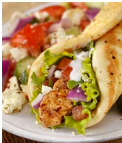
*50888-Pork Souvlaki 4oz 20 Skewers/case | $57.00