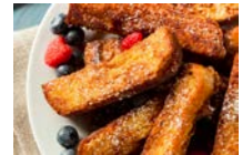
77951- French Toast Sticks Approx. 100 Sticks | $50.00