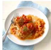
79733- Cabbage Rolls 2 x 16 Piece Trays | $65.00