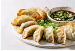
73485- Shrimp Dumplings 1lb Bag | $10.00