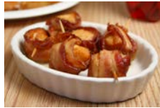
*73154- Bacon Wrapped Scallops 2.2lb Bag | $39.00