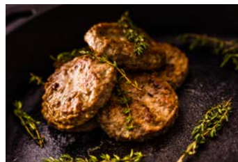
*51363- 1.6oz Breakfast Sausage Patties Fully Cooked 100 Patties | $82.00