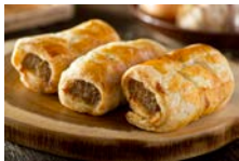
78991- 4oz Sausage Rolls 48 rolls | $69.00