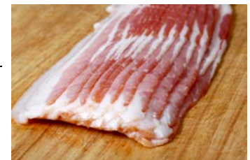
*55361-Natural Smoked Bacon 5 x 1lb Packages | $47.00