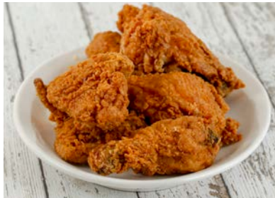
60257-KFC Style Breaded Chicken approx. 18pc/bag | $45.00