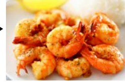
*74169- 16/20 Black Tiger Prawns 2lb Bag | $33.00